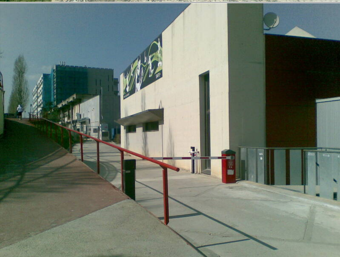
5 - Access barrier. When you reach the barrier, you will have to call security on campus and request them to open it. Press the "Call" button and when they answer you, tell them you are going to the "Servei de Ressonància", and they should open the barrier for you.

https://sermn.uab.cat/wiki/ Printed on 2023/12/10 01:41