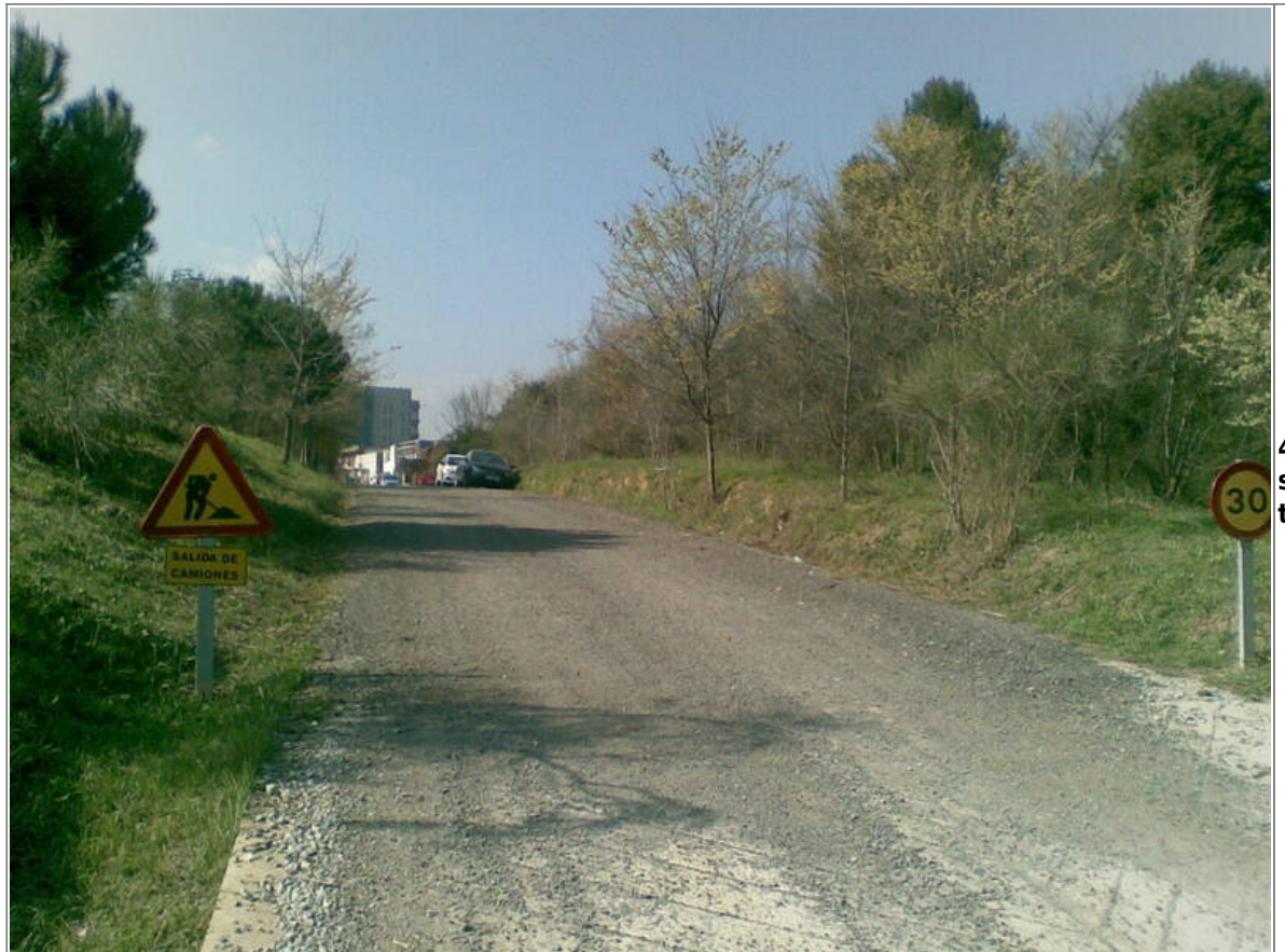
4 - Drive straight to the end.